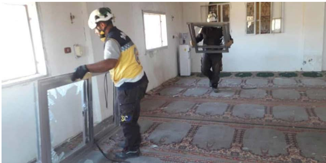
Photo 18: Extent of damage to Al Hassan and Hussein Mosque as a result of being shelled on 8 July 2019