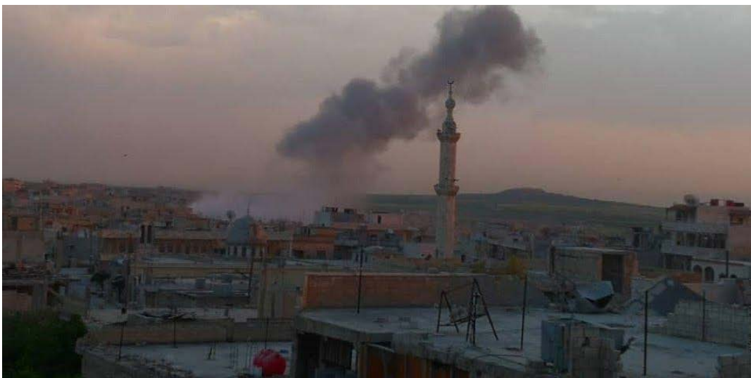
Photo 12: Targeting the neighbourhoods of the city of Khan Sheikhoun on 15 May 2019