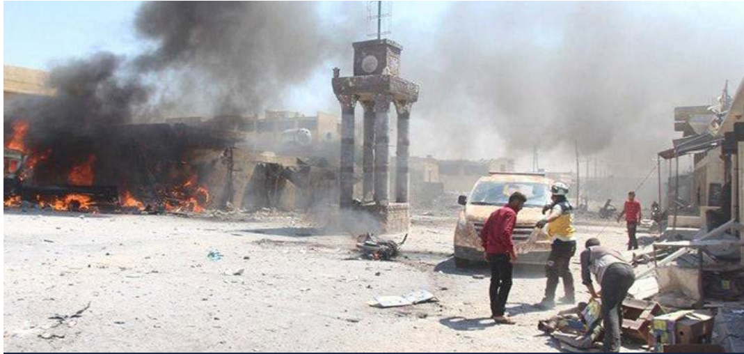
Photo 21: Shelling the public market in the town of Hayesh town on 20 June 2019