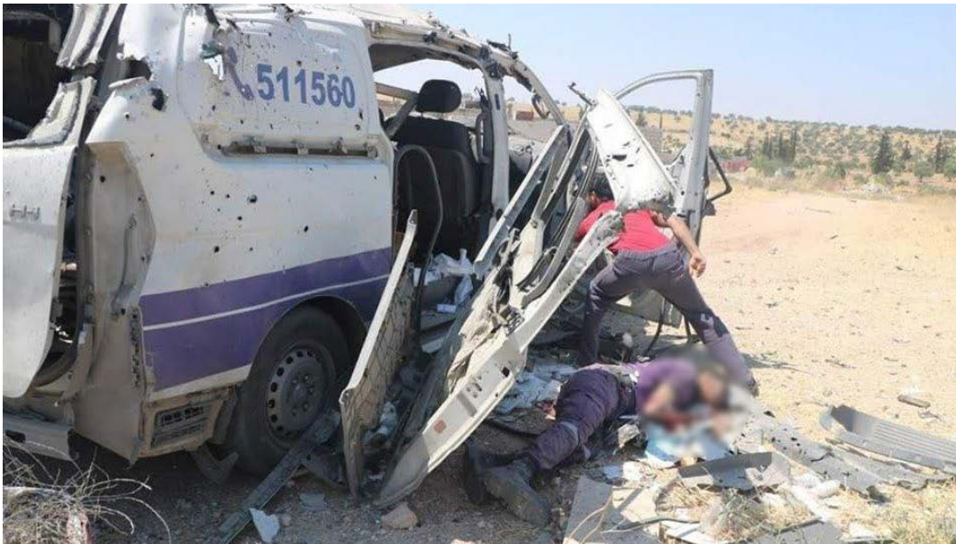
Photo 8: Ambulance car which has been targeted in June 2019.

Syrian Air Force warplanes targeted an ambulance car belonging to Banafsj Organisation/ Maarat al-Numan sector on Thursday morning, 20 June 2019. The airstrike resulted in killing three people, including two paramedics, and wounding three others in the ambulance while transporting individuals who were injured in an aerial bombardment of the town of Hayesh, which killed three people, as a result of an earlier attack by Syrian government aircrafts. (Photo 8)