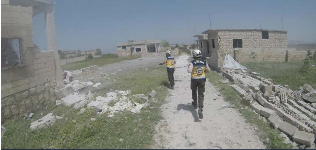
Photo 23: Members of the civil defense trying to evacuate houses as a result of shelling in the town of Ablin. | Source: Syrian Civil Defense