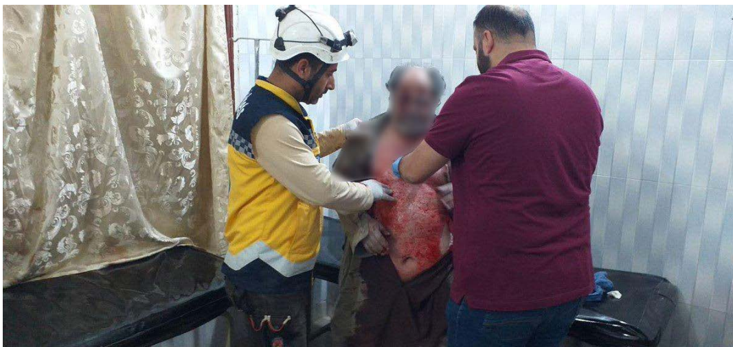
Photo 19: A wounded person being treated from injuries caused by the attack on the public market in the town of Ras Al-Ain on 7 May 2019

Russian warplanes launched airstrikes targeting the public market in the town of Ras al-Ain in the eastern countryside of Idlib with vacuum air- missiles on 7 May 2019. The shelling killed three civilians, injured eight and caused large-scale destruction of shops and houses. (Photo 19)