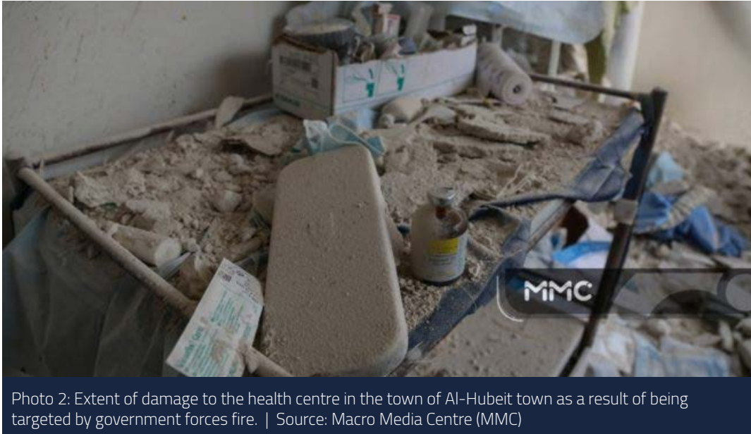
Photo 2: Extent of damage to the health centre in the town of Al-Hubeit town as a result of being targeted by government forces fire.