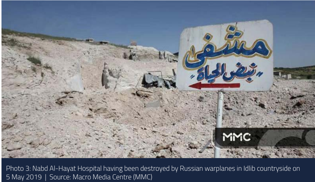
Photo 3: Nabd Al-Hayat Hospital having been destroyed by Russian warplanes in Idlib countryside on 5 May 2019