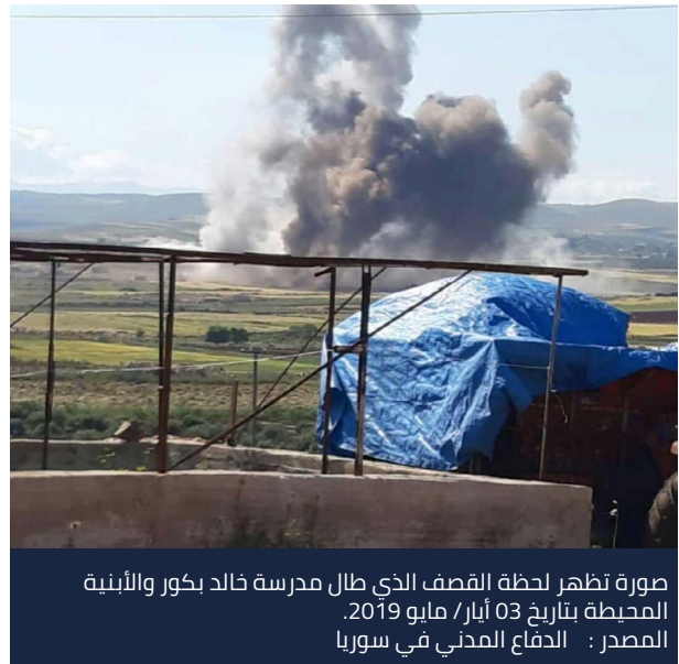
صورة تظهر لحظة القصف الذي طال مدرسة خالد بكور والأبنية المحيطة بتاريخ 03 أيار / مايو 2019.

Syrian Air Force warplanes carried out an airstrike against Khaled Bakkour School in the town of Al-Hubeit in Idlib governorate on 3 May 2019. The shelling caused extensive damage to