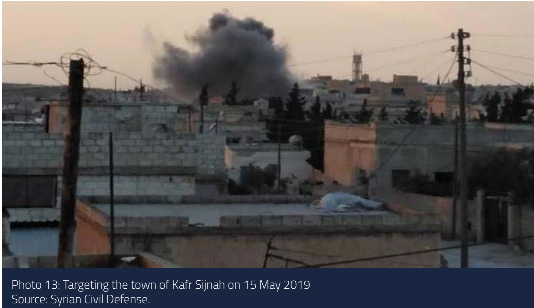
Photo 13: Targeting the town of Kafr Sijnah on 15 May 2019

Syrian warplanes carried out successive airstrikes with vacuum air-missiles on Kafr Sijnah School in Idlib governorate on 15 May 2019. The shelling caused extensive damage to the school, leaving it out of service. (Photo 13)