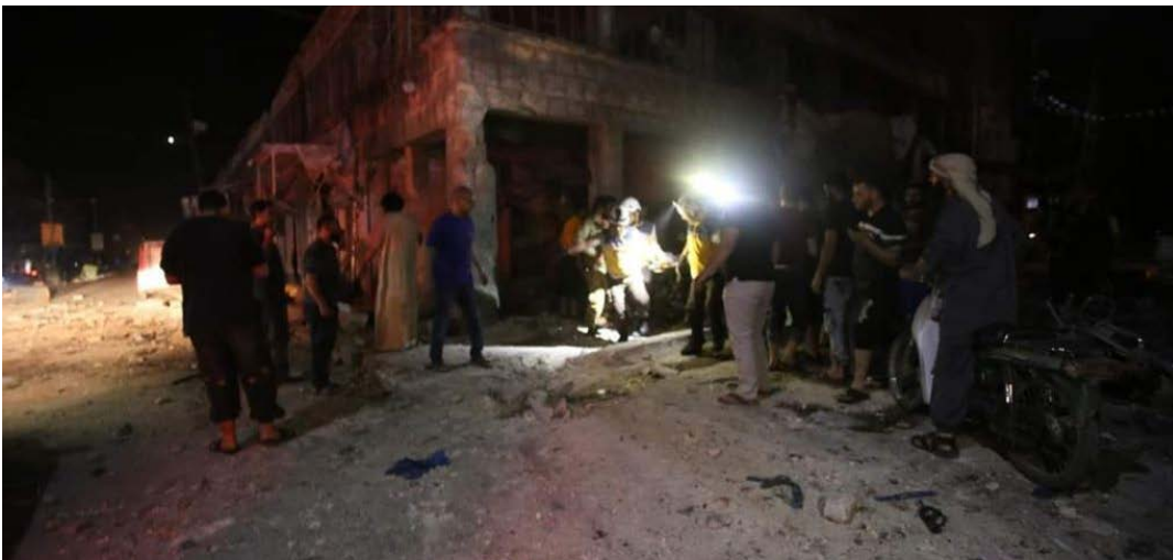
Photo 20: Extent of destruction of shops resulting from shelling by Syrian government forces on 21 May 2019

Syrian warplanes launched intensive airstrikes targeting the public market in the city of Ma’aret al-Nu’man in the governorate of Idlib on 21 May 2019. The shelling resulted in the killing of 3 civilians, the injury of 7 and large-scale destruction of shops. (Photo 20)