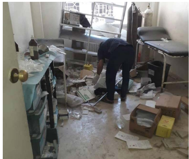
Photo 9: the extent of destruction of Jisr al-Shughour Surgical Hospital in Idlib governorate on 10 July 2019.

Syrian Air Force warplanes targeted Jisr al-Shughour Surgical Hospital in the centre of Jisr Al-Shughour city in Idlib governorate on Wednesday, 10 July 2019. The shelling killed six people, mostly children and women, and wounded dozens, several of them critically. The shelling caused extensive destruction of the building of the hospital, surrounding buildings, interior fittings and rescue mechanisms. Consequently, the hospital was put out of service. (Photo 9)