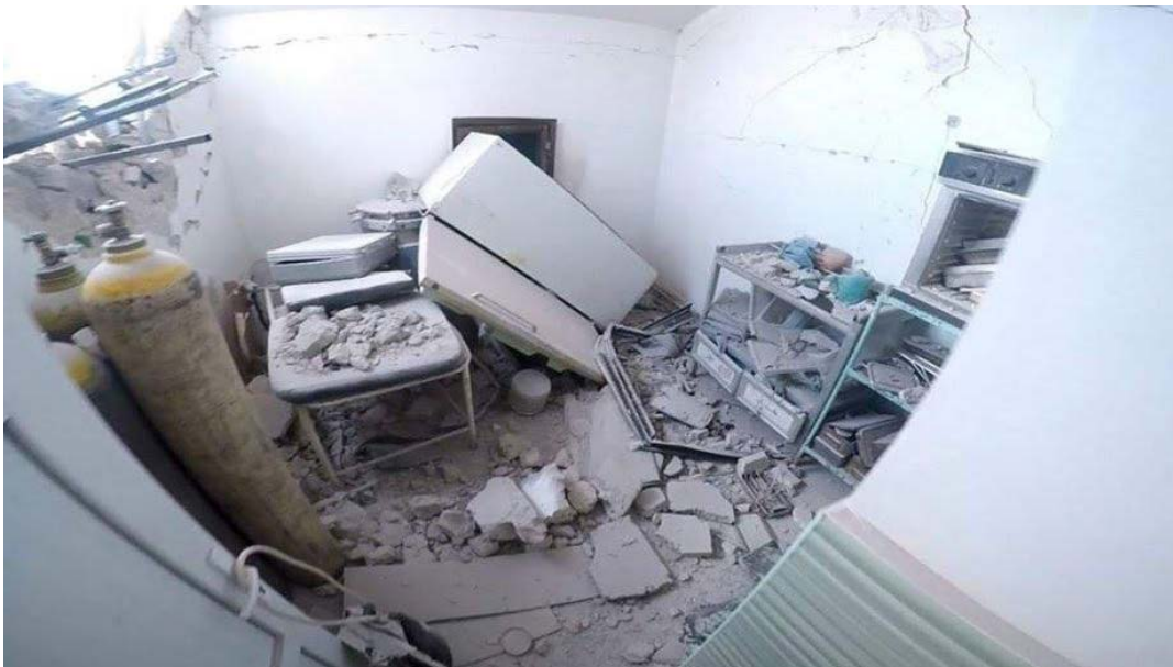
Photo 10: Extent of damage in Al-Rahma Private Hospital as a result of being targeted on 21 August 2019.

Russian warplanes targeted the Al-Rahma Private Hospital in the town of Telmens in the eastern countryside of Ma'rat al-Nu'man with four airstrikes on 21 August 2019. The shelling completely destroyed the hospital and put it out of service. With the exception of one civilian who happened to be in the premises at the time of the airstrike, no casualties were recorded among the hospital staff or its users. This is because the hospital was evacuated at an earlier time. (Photo 10)