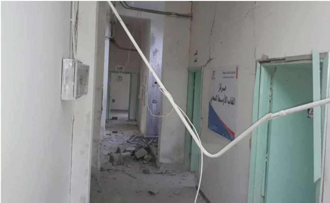
Photo 5: Extent of damage to Al-Ghab Medical Centre caused by the bombardment of Syrian helicopters on 7 May 2019 | Source: Health Department of Hama.

Using barrel bombs, Syrian government helicopters bombed al-Ghab Medical Centre in al-Hawija village in al-Ghab area of Hama governorate on 7 May 2019. The shelling caused extensive destruction of the centre and surrounding facilities, leaving the centre out of service. (Photo 5)