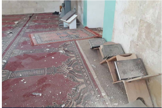
Photo 17: Extent of damage to the inner sanctum of Al-Makateb Mosque Saraqeb on 22 May 2019.

Russian Sukhoi-24 warplanes carried out successive airstrikes with vacuum air-missiles on the village's mosque in Idlib countryside on 8 July 2019. The shelling killed three people, a woman and her two children, and completely destroyed the mosque. (Photo 18)