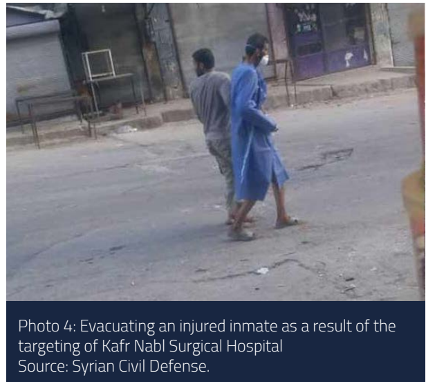
Photo 4: Evacuating an injured inmate as a result of the targeting of Kafr Nabl Surgical Hospital

Russian warplanes carried out an airstrike targeting the vicinity of the Paediatric Hospital in the town of Termla in rural Idlib on 5 May 2019. The shelling destroyed the building of the hospital and damaged medical equipment, leaving the hospital out of service.