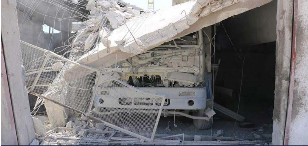
Photo 22: Extent of damage in the civil defense centre in the city of Kafr Nabl with on 13 May 2019