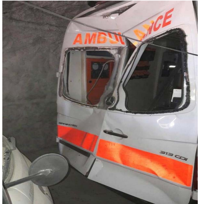
Ambulance destroyed at the ambulatory centre as a result of the aerial bombardment in Latamna

Russian warplanes targeted an ambulatory centre in the town of Latamna in Hama countryside on 29 April 2019, completely destroying the hospital and medical equipment (Photo 1).