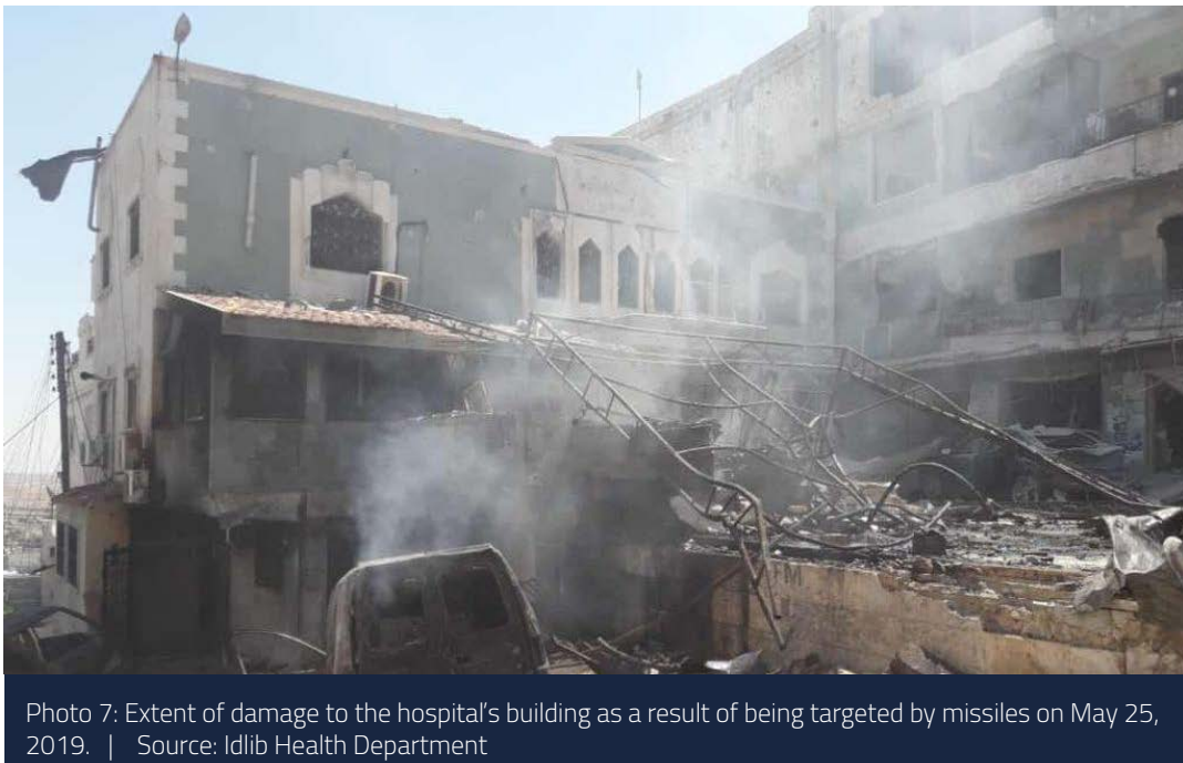
Photo 7: Extent of damage to the hospital's building as a result of being targeted by missiles on May 25, 2019.