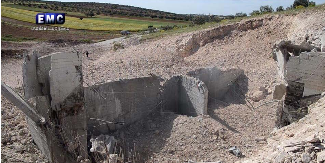
Photo 6: Extent of damage to the hospital's building as a result of being targeted by vacuum air-missiles.

Russian warplanes carried out an airstrike on Nabd Al-Hayat Hospital in the town of Hass in Idlib Governorate with three successive missile attacks on 10 May 2019. The shelling completely destroyed the hospital, leaving it out of service. The hospital served more than 5,000 users. (Photo 6)