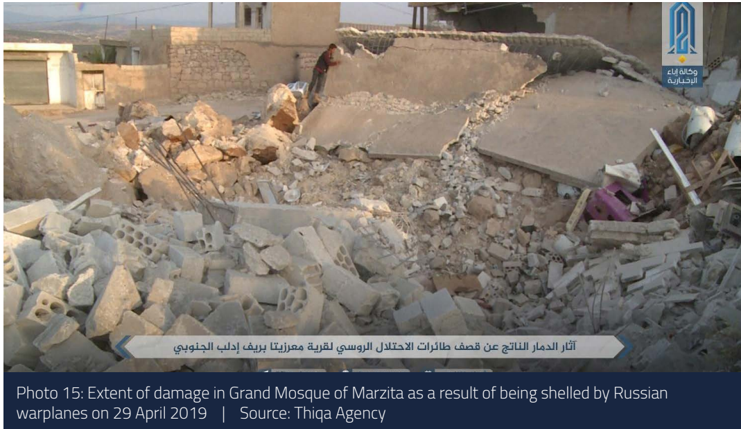
Photo 15: Extent of damage in Grand Mosque of Marzita as a result of being shelled by Russian warplanes on 29 April 2019

Russian warplanes launched successive airstrikes with rocket-propelled grenades on the centre of the village of Marzita on 29 April 2019. One raid targeted the Grand Mosque of Marzita in the town in the southern countryside of Idlib. The shelling completely destroyed the mosque and put it out of service. (Photo 15)