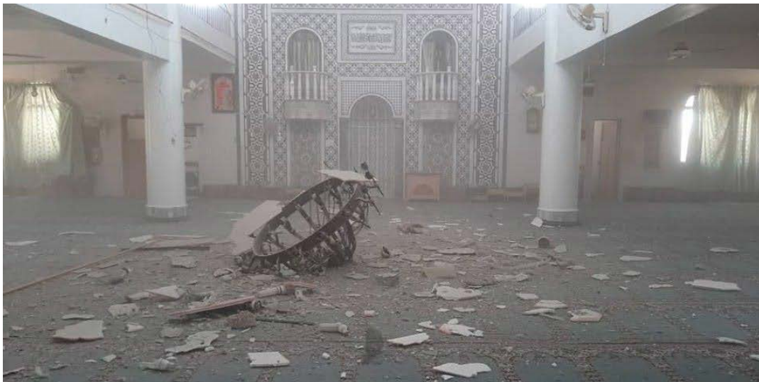
Photo 14: extent of damage in Al-Rahman Mosque as a result of being targeted 7 June 2019

Syrian warplanes launched successive airstrikes with vacuum air-missiles on Al-Rahman Mosque on the city of Khan Sheikhoun in Idlib countryside 7 June 2019. The shelling damaged the roof of the mosque and large parts of its walls, putting it temporarily out of service. (Photo 14)