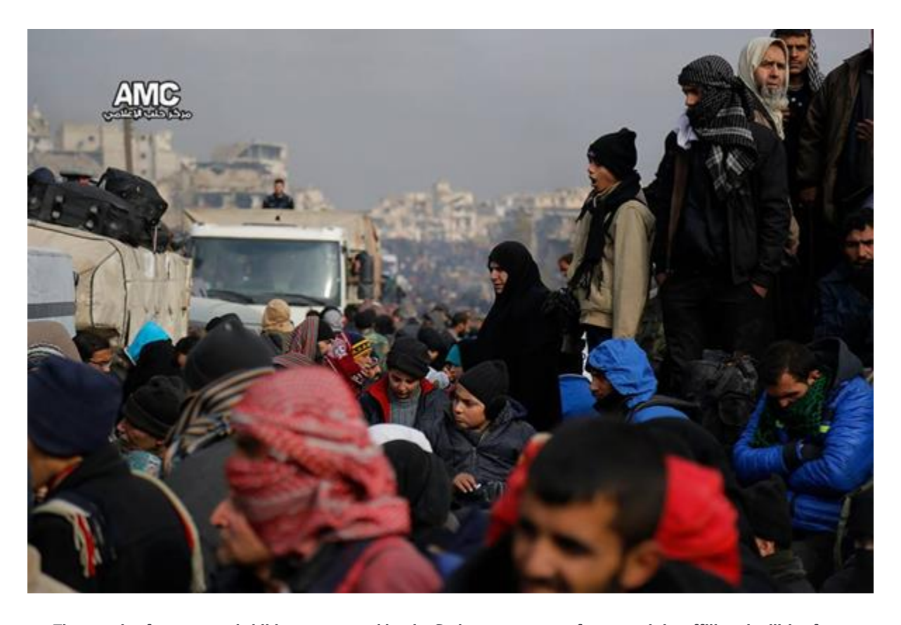
Thousands of women and children prevented by the Syrian government forces and the affiliated militias from leaving eastern Aleppo on Friday, December 16<sup>th</sup>.